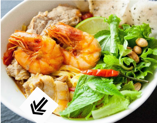
Danang Specialty ¥1,090