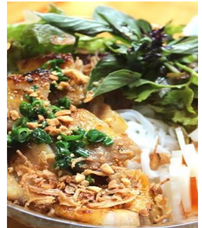
Grilled Pork with Rice Vermicelli ¥1,000 烤肉蔬菜拌檬粉