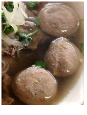
Beef Meat Ball 牛肉丸子 + ¥230