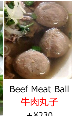
Beef Meat Ball 牛肉丸子