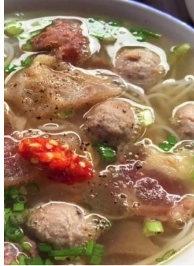
Beef Meat Balls with Vermicelli 牛肉丸子牛筋米粉 ¥1,030