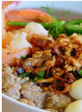
Mixed Rice Noodle Soup 什锦米粉 ¥1,030