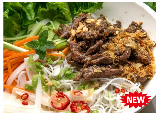
Rice Vermicelli and Stir-fried Beef with Chilli Lemongrass ¥1,180 炒牛肉蔬菜拌檬粉