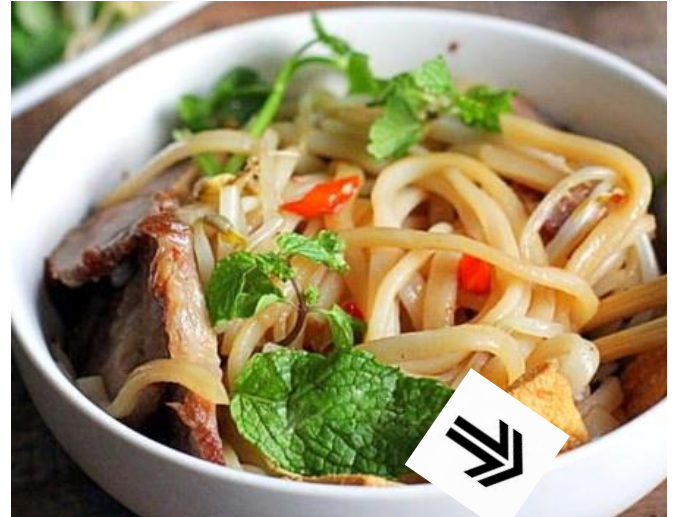
Special Spicy Beef ¥1,150