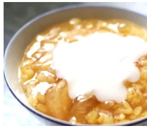
Mung Beans Sweet Soups Desserts 绿豆粥