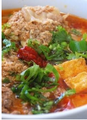
Crab Based Soup with Vermicelli 蟹肉丸子米粉 ¥1,030