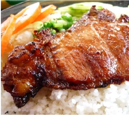
Grilled Pork Chops with Rice