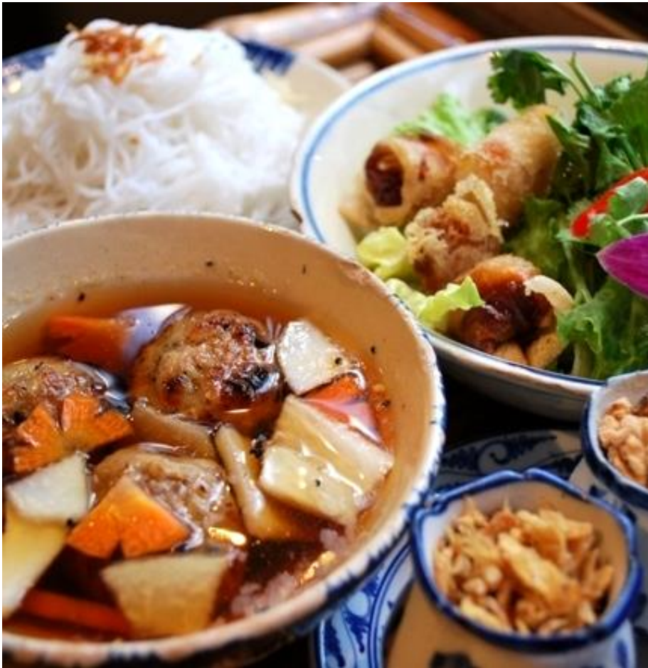
Spicial Rice Vermicelli ¥1,000 越南超級拌檬粉

★ BUN + Today's Dessert ※a refill of one's Rice Vermicelli +¥100 越南拌檬粉 + 今天的甜品 ※再添一碗檬粉 +¥100