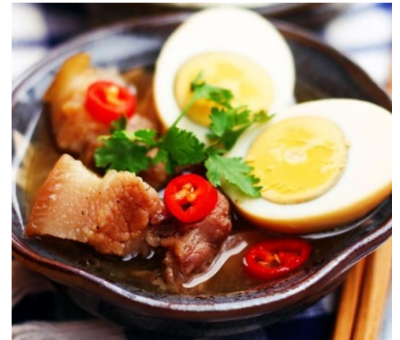
Tender Simmered Pork and Egg with Rice