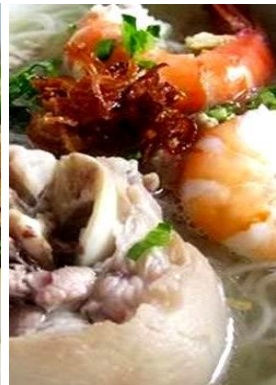
Special Mixed Noodle Soup 猪蹄什锦米粉 ¥1,180