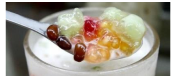
Lotus Seeds in Longan with Syrup 莲子龙眼馅蜜