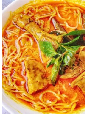
Chicken Curry with Vermicelli 鸡肉咖喱米粉 ¥1,030