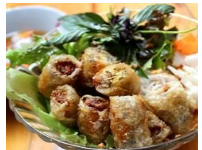
¥1,000 Fried Spring Rolls with Rice Vermicelli 炸春卷蔬菜拌檬粉