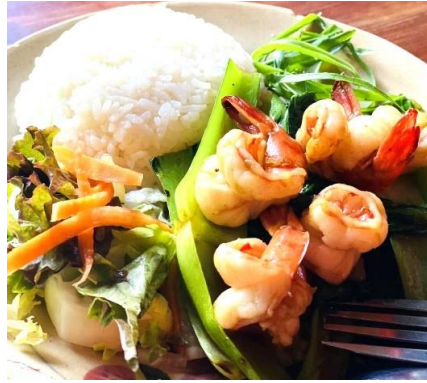
Stir-Fried Shrimp and Bok Choy with Rice