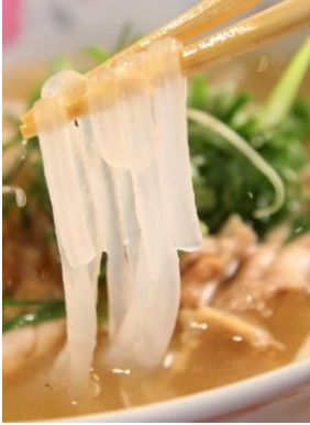
Tapioca Noodle with Chicken 鸡肉西米粉 ¥950