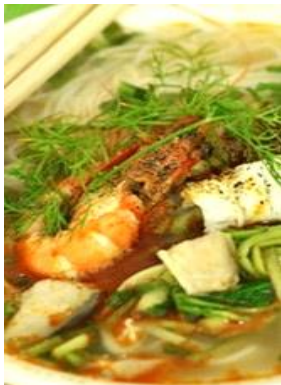
Glass Noodle with Seafoods 海鲜什锦粉丝 ¥1,030