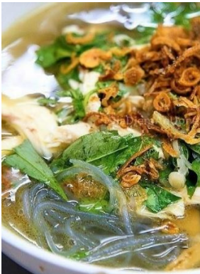
Glass Noodle with Chicken 鸡肉粉丝 ¥950