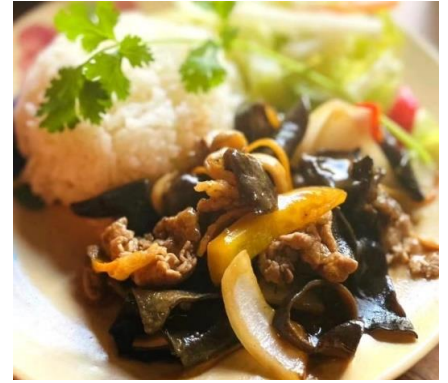
Stir-Fried Beef and Onion with Rice