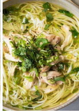
Boiled Chicken with Vermicelli 鸡肉米粉 ¥950