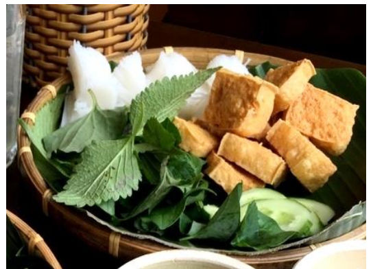
Rice Vermicelli with Tofu ¥880 虾酱豆腐拌檬粉