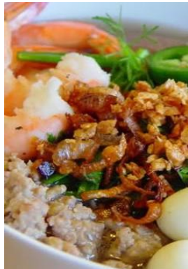
Mixed Rice Noodle Soup 什锦米粉 ¥1,030