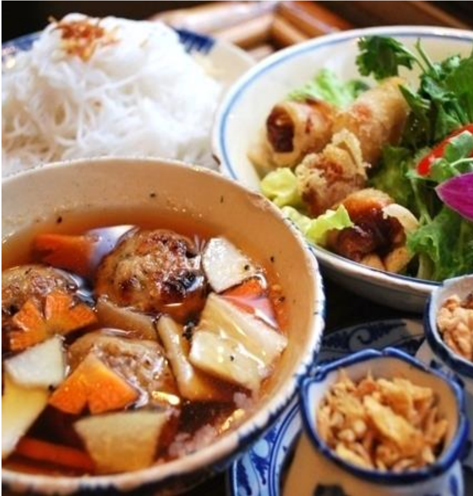
Spical Rice Vermicelli ¥1,000 越南超級拌檬粉