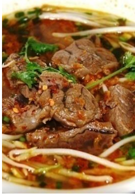
Spicy Beef Noodle Soup 辣味牛肉乌冬面 ¥1,000