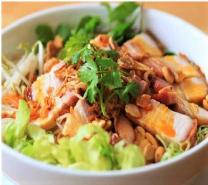
Vietnamese Salted Pork with Rice