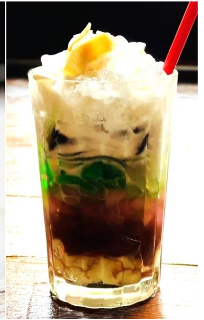
Vietnamese Mixed Shaved Ice