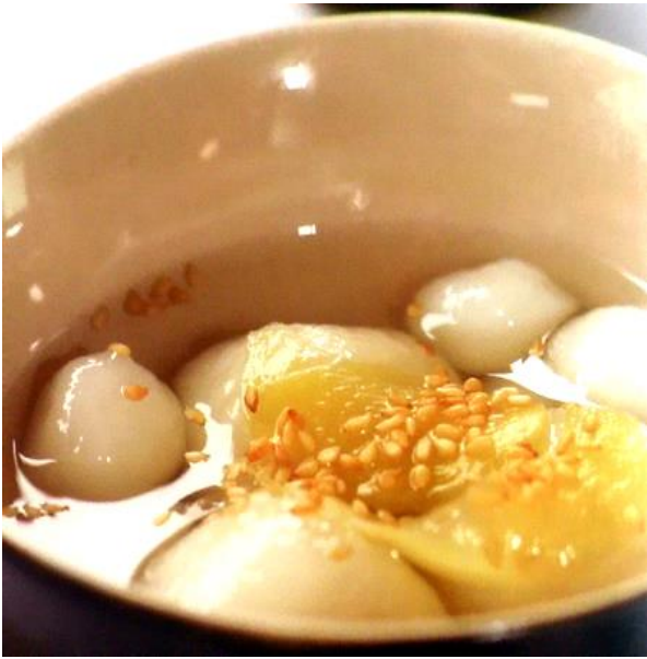
Sticky Rice Dumplings with Caramel Ginger Syrup