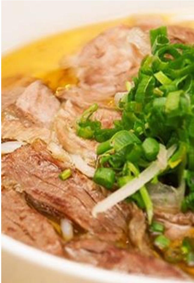
Special Beef Rice Noodle Soup