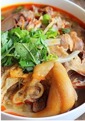
Special Spicy Beef Noodle Soup 牛肉猪蹄乌冬面 ¥1,150