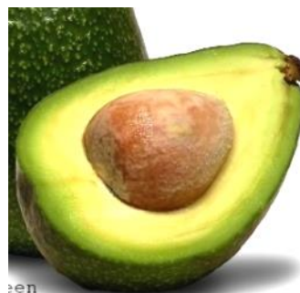
Avocado Ice Cream