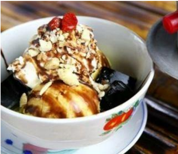
Vanilla Ice Cream in Vietnamese Espresso Coffee