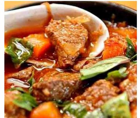
Spicy Beef Stew with Baguets or Rice