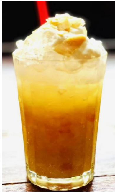
Pomelo Sweet Soup Pomelo Shaved Ice