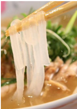
Tapioka Noodle with Chicken 鸡肉西米粉 ¥950