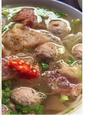
Beef Meat Balls with Vermicelli 牛肉丸子牛筋米粉 ¥1,030