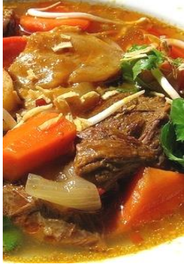
Beef Stew with Vermicelli 炖牛肉米粉 ¥1,030