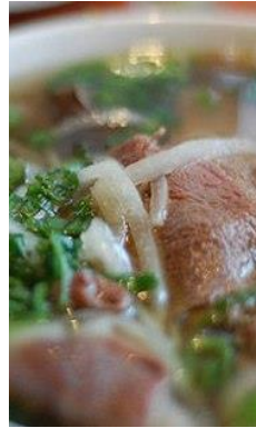
Raw Beef 生牛肉河粉