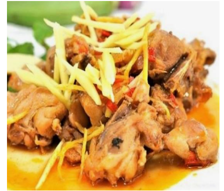
Ginger Coconut Milk Chicken with Rice