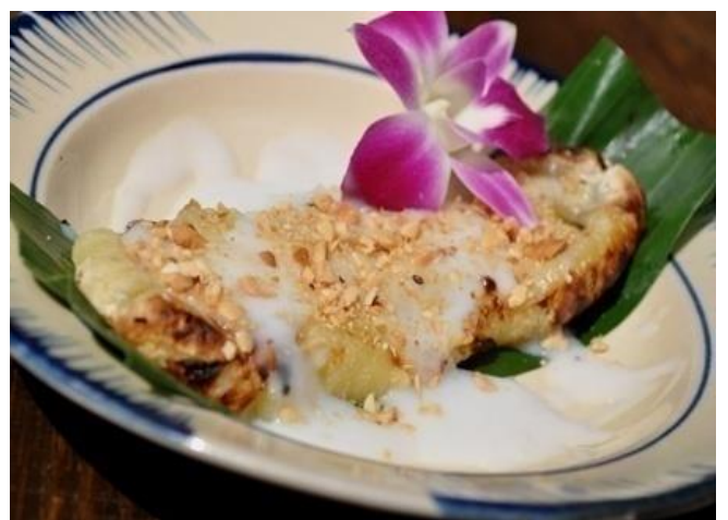
Grilled Banana with Peanut Coconut Sauce