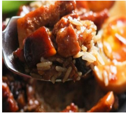
Tender Simmered Pork and Egg with Rice