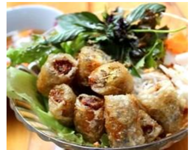
Fried Spring Rolls with Rice Vermicelli ¥1,000 炸春卷蔬菜拌檬粉