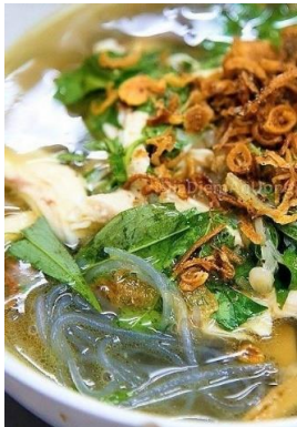
Glass Noodle with Chicken 鸡肉粉丝 ¥950