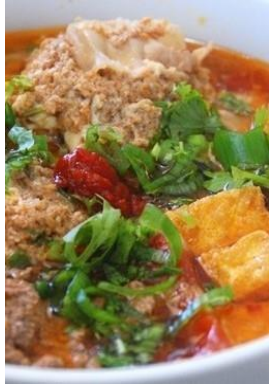
Crab Based Soup with Vermicelli 蟹肉丸子米粉 ¥1,030