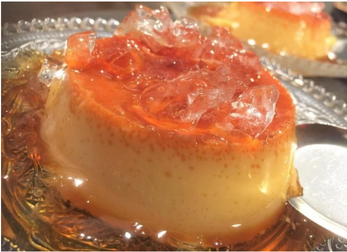
Vietnamese Custard Pudding