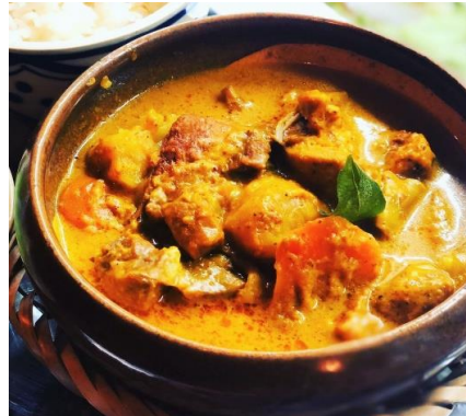
Chicken Coconut Curry with Baguets or Rice