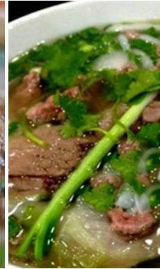
Cooked Beef 熟牛肉河粉