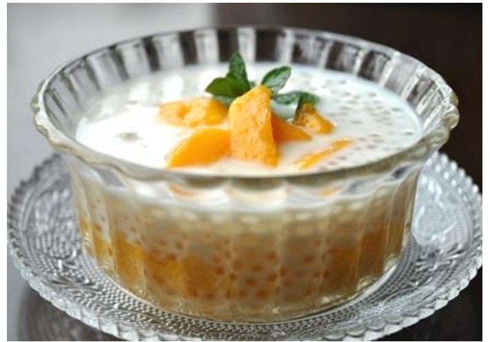
Mango and Tapioka in Coconut Milk