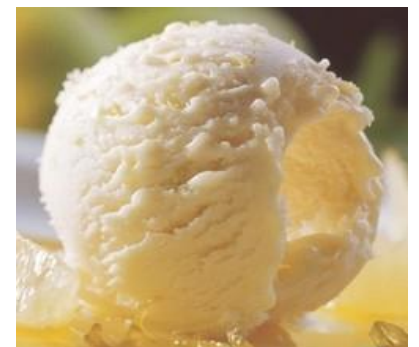
Vanilla Ice Cream