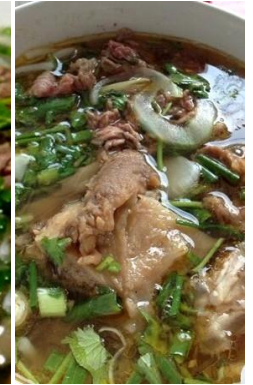
Sinewed Beef 熟牛筋河粉