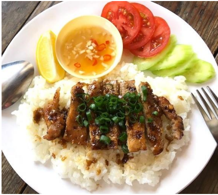
Grilled Pork Chops with Rice