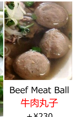
Beef Meat Ball 牛肉丸子