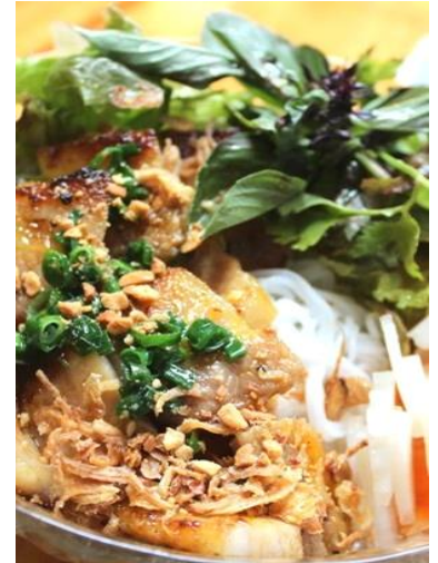
Grilled Pork and Herbs with Rice Vermicelli ¥1,000 烤肉蔬菜拌檬粉