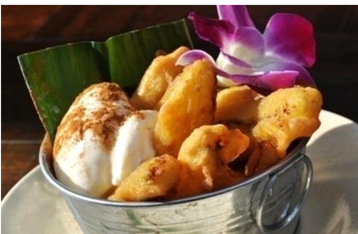
Fried Banana with Cinnamon Sugar