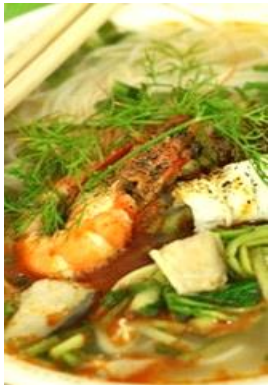
Glass Noodle with Seafoods 海鲜什锦粉丝 ¥1,030