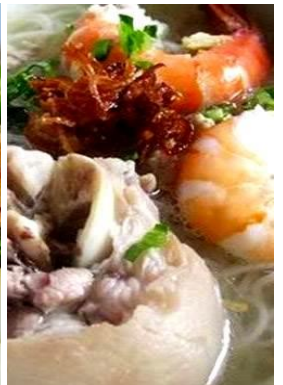
Special Mixed Noodle Soup 猪蹄什锦米粉 ¥1,180