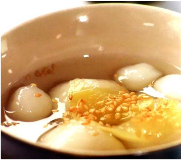
Sticky Rice Dumplings with Caramel Ginger Syrup 生姜汤圆