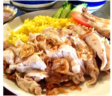
Vietnamese Chicken Rice Boiled Chicken and Fried Chicken