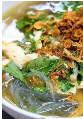
Glass Noodle with Chicken 鸡肉粉丝 ¥950