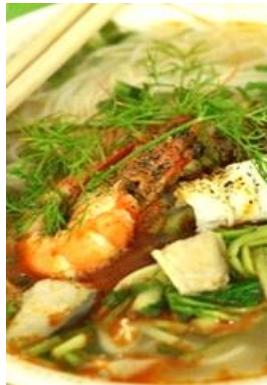
Glass Noodle with Seafoods 海鲜什锦粉丝 ¥1,030