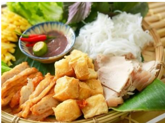
Rice Vermicelli with Boiled Innards Assorted and Tofu with Annnchovy Sauce ¥1,030 虾酱猪内脏什锦拌檬粉