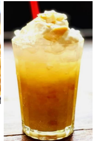
Pomelo Shaved Ice 柚子刨冰