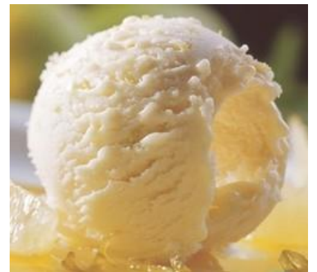
Vanilla Ice Cream