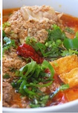
Crab Based Soup with Vermicelli 蟹肉丸子米粉 ¥1,030