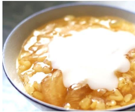
Pomelo Sweet Soup 柚子汤