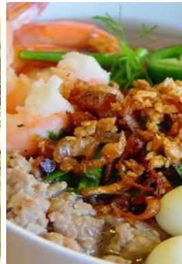
Mixed Rice Noodle Soup 什锦米粉 ¥1,030