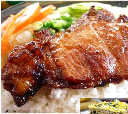
Grilled Pork Chops with Rice