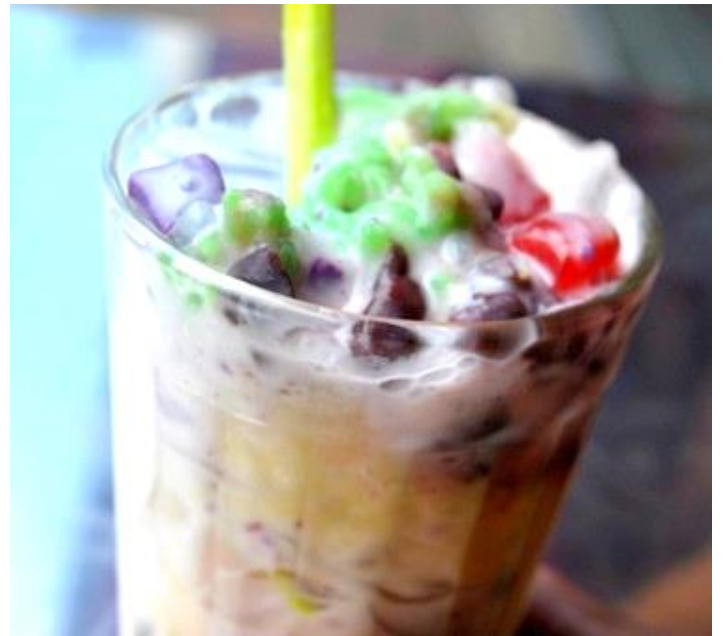
Vietnamese Mixed Shaved Ice 越南人气拼盘刨冰