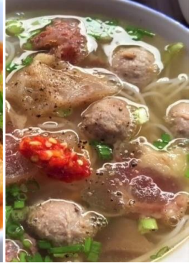
Beef Meat Balls with Vermicelli 牛肉丸子牛筋米粉 ¥1,030