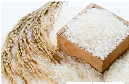
GAO TẤM THƠM