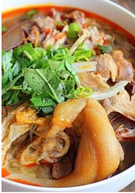
Special Spicy Beef Noodle Soup 牛肉猪蹄乌冬面 ¥1,150