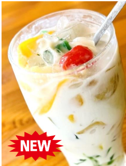
Dorian ·Litchi Jack Fruit